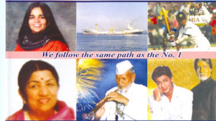
We follow the same path as the No. 1

Affiliated to Union Network International, (UNI) Switzerland